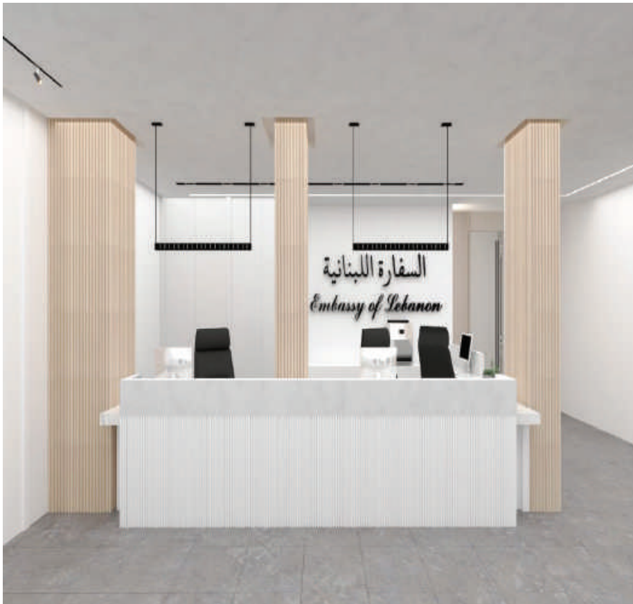
The Embassy of Lebanon, Abuja, Nigeria (MEP works)