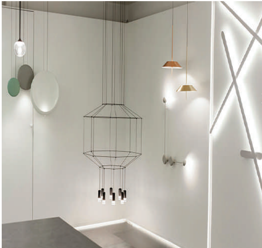
Display of decorative lighting fitting, random showroom.