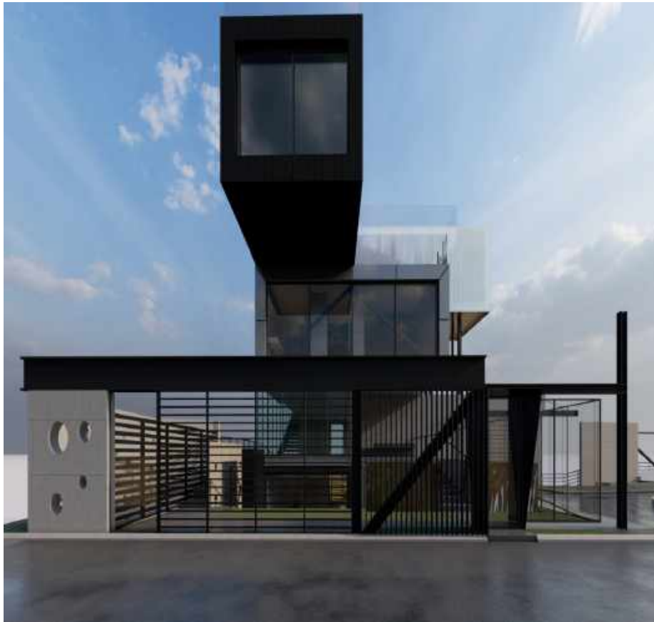
Private Residence, Adma, Lebanon