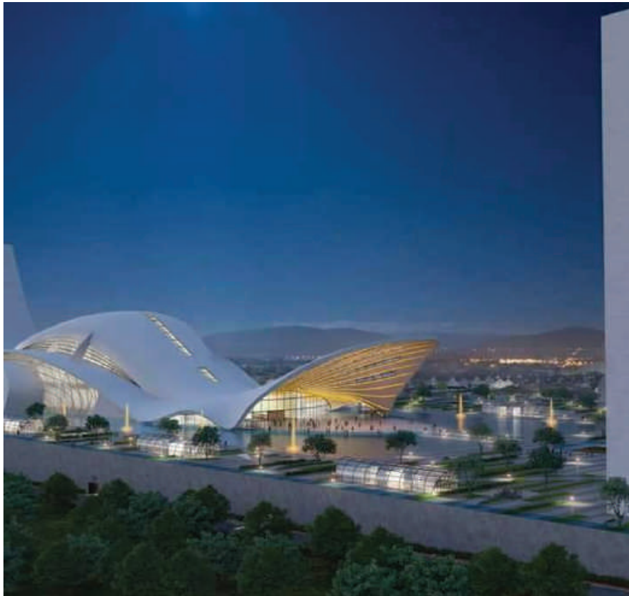
Ibom International Worship center, Nigeria