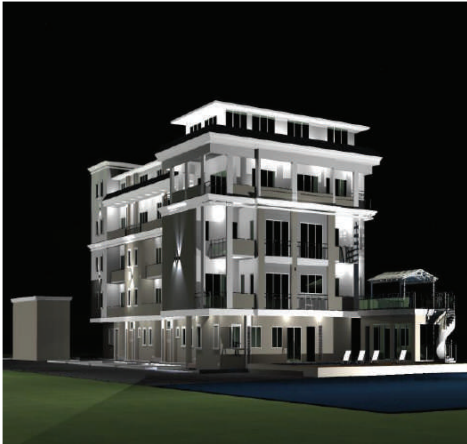
Private residential building, Banana Island, Lagos, Nigeria