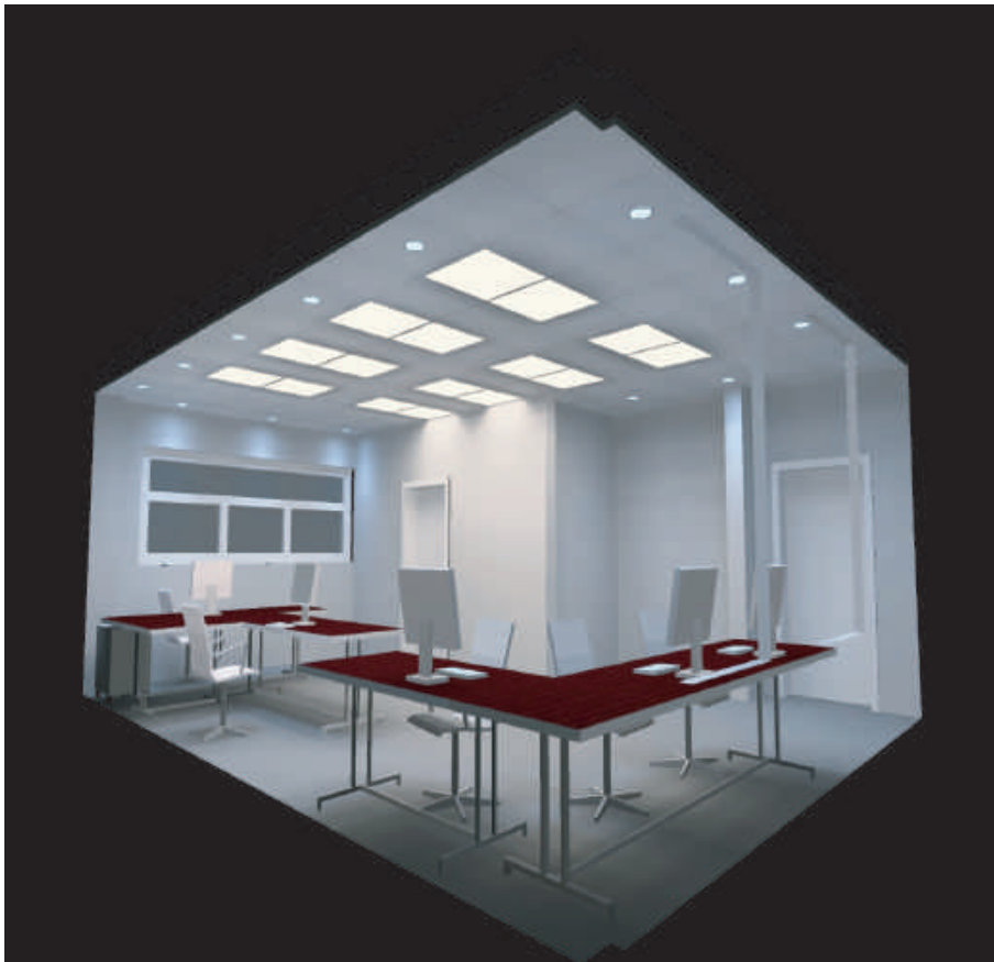
Studio Light office , Lagos