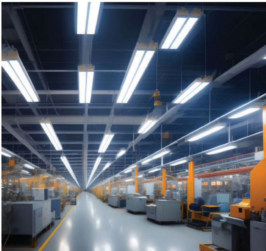
AI generated image for a LED factory