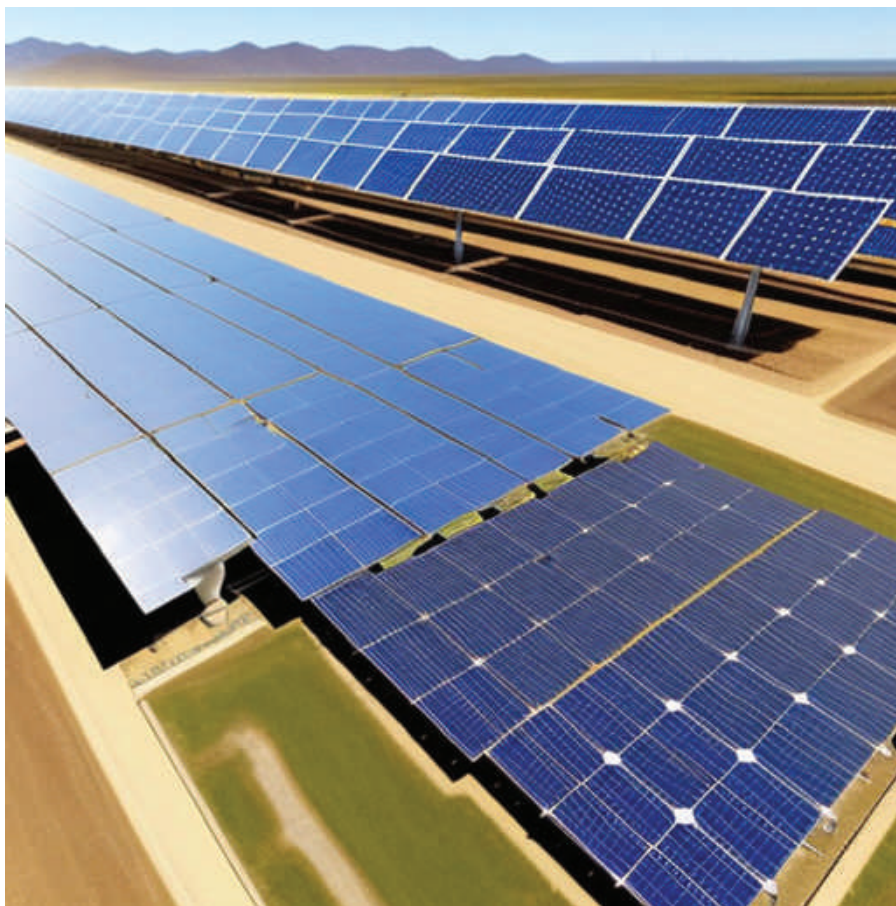
AI generated image for a solar farm